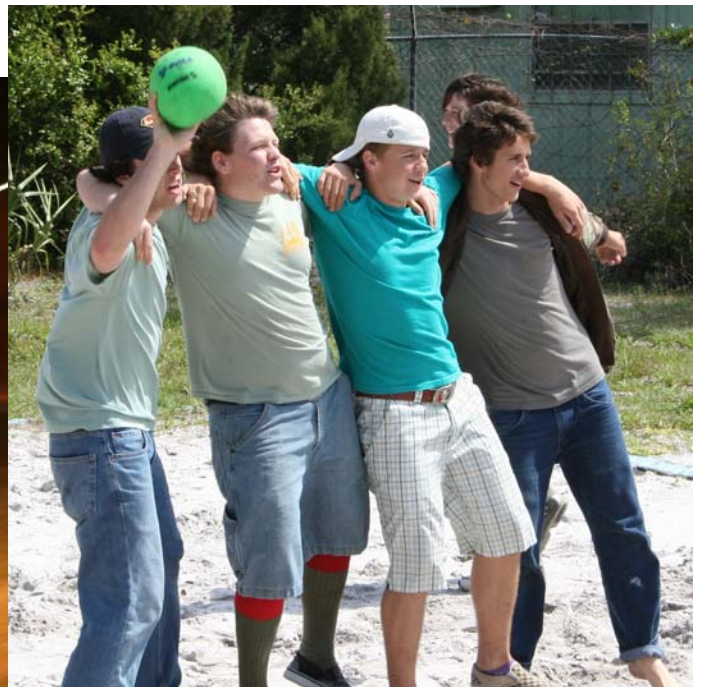
More Chapter Ball!