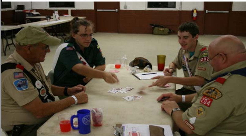
The Hearts Tournament