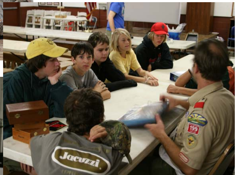
The Patch Collecting Seminar.