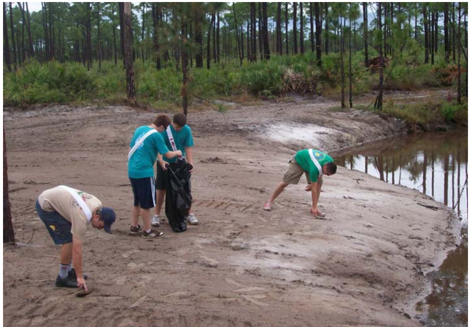
The OA helps the Gulf Stream Council Clean-up.