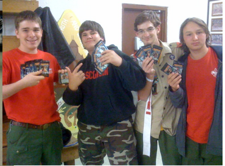
The Magic: The Gathering Tournament which included 20 Arrowmen and 5 hours of play.