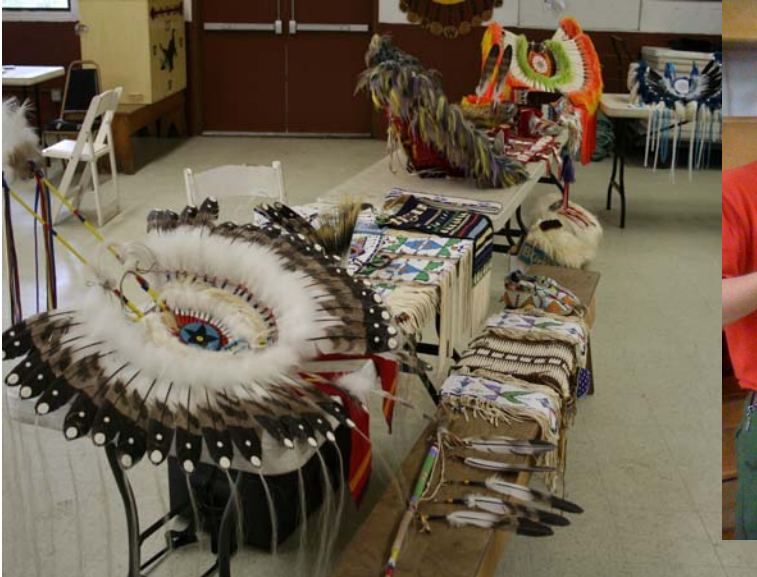
The Native American Seminar.