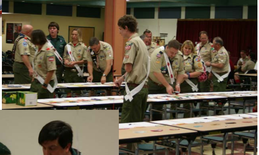
Let the silent auction begin!