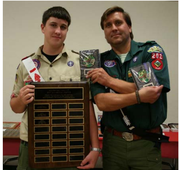
Coo-Wa-Chobee Wins Best-All-Around Chapter