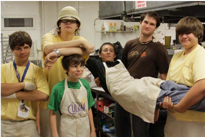
The Food Masters.