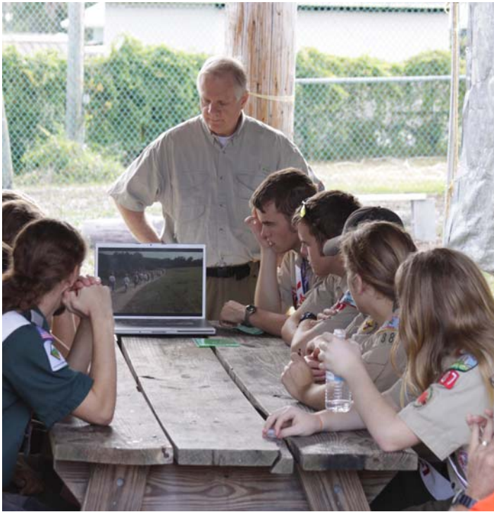
One of Many Informative Seminars