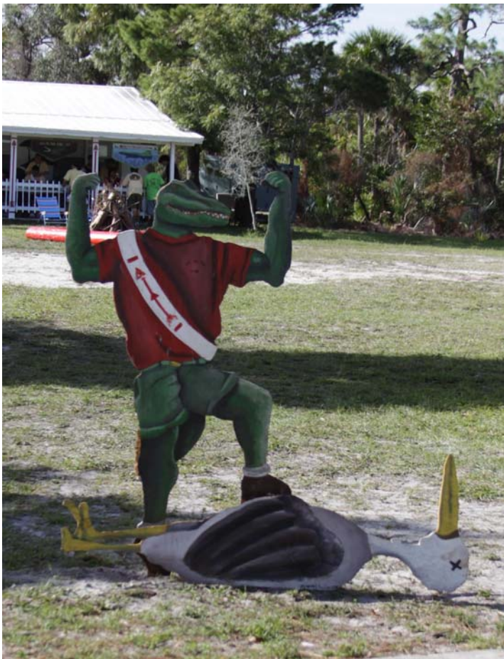
You can never beat the classics.

If you were not in attendance for this weekend, then you truly missed out on a lot. Next time that there is another event of this caliber, I suggest that you go out of your way to attend, you will not regret doing so.