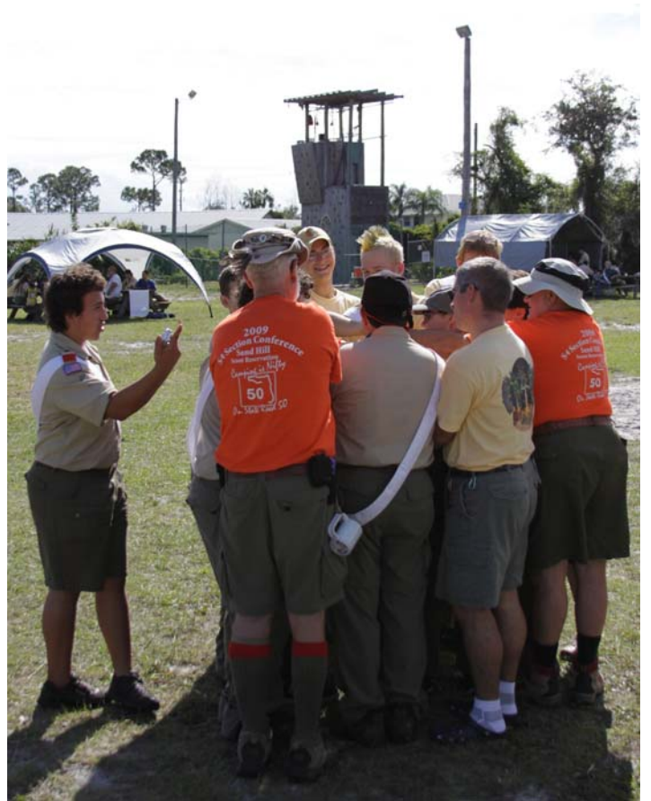
Naturally there were games.

Visit www.gallery.aal-pa-tah237.org for over 10,000 more pictures. Yea, that's pictures for ya, lots more pictures!